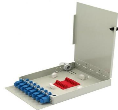
Din-Rail Mount Termination Box