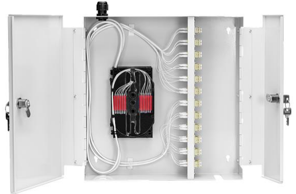
Wall Mount Termination Box

GZ Solution fiber optic termination box (FOTB) Series are used to distribute, splice, and store the optical cables which enter from the bottom of the termination boxes. There are two connection ways: direct connection and splitting /Midspan connection. Applicable for indoor usage inside buildings, Rooms or Closed cabins and Outdoor Applications.