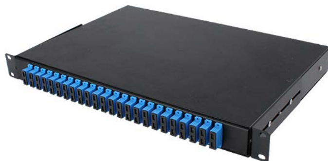
19" Patch Panel upto 48F

GZ SOLUTIONS fiber optic patch panel (FOPP) Series are used to terminate network or equipment cables for FTTH, WAN & Industrial Networks. The patch panel connects fibers coming from one or several network cables to connectors.