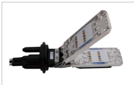
Individual fixed tray