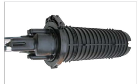
Fixing with shrinkable tube